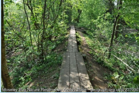
Moseley Bog Nature Reserve

Moseley Bog Archaeology walk, Saturday 29 January, 11am and 2pm. Free, but booking essential mosbogfriends@gmail.com