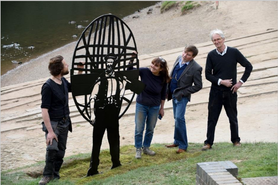
Coracle man sculpture

Details of the trust and their events and activities can be found on their website ( https://ironbridgecoracles.org/ ) or Ironbridge Coracle Trust Facebook. Their work has been supported by funding from the Heritage Fund, Arts Council England and Telford & Wrekin Council.