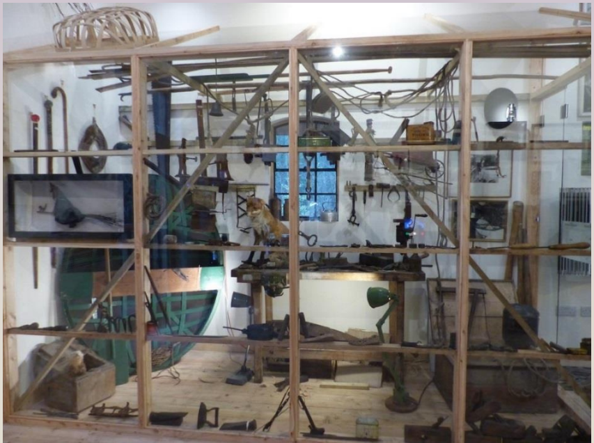
New coracle shed