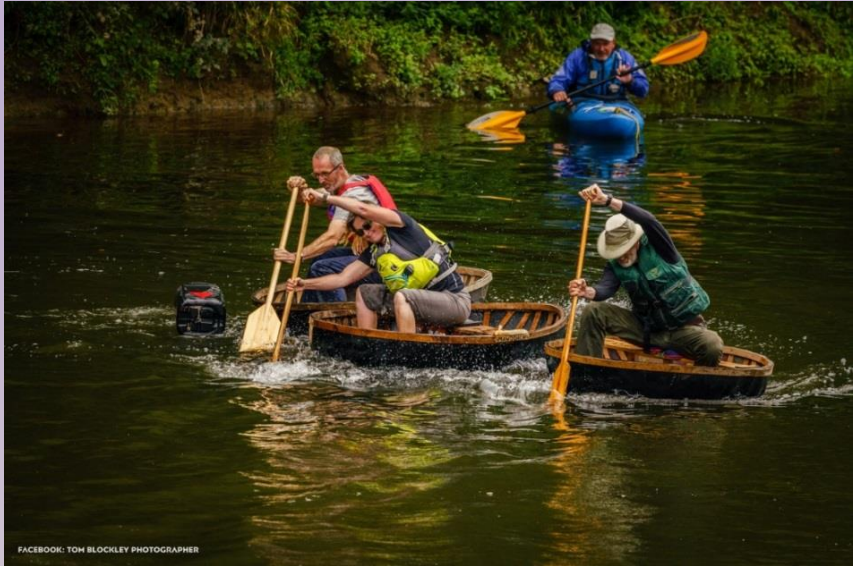
Coracle regatta